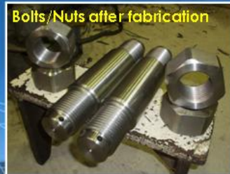
Bolts/Nuts after fabrication