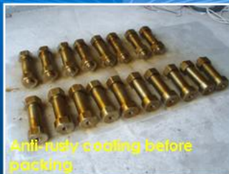
Anti-rusty coating before packing

Please find a photo sample of our work, during of fabrication of Tailshaft Coupling Bolts/Nuts by certified material of high tensile/yield strength.