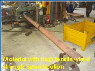
Material with high tensile/yield strength specification