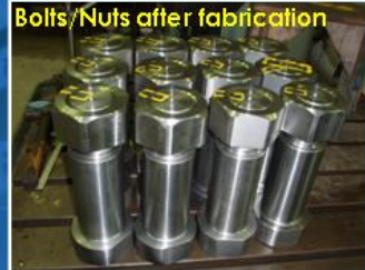
Bolts/Nuts after fabrication